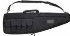
Added Padding Protects Rifle & Optics

A shell of abrasion- and mildew-resistant, 1000 denier, Nytaneon nylon surrounds 3/8" of padding on the top and bottom of the case for snug, no-slip protection of your rifle and its expensive optics. Padding on the bottom of the case covers the zipper tracks to protect your rifle from scratches. A double-stitched, nylon carry handle is attached to the case with multi-reinforced stitching; an adjustable, padded sling offers a tactical-carry option. All cases accept rifles with mounted optics and fully unzip to be used as a shooting mat. Standard Rifle case is available in 34", 37", and 41" lengths and features four high-capacity magazine pouches (five on 41" case) with positive-close hook-and-loop patch closures, plus zippered compartments in the front for additional storage. SPECS: 1000 denier, Nytaneon nylon, black.