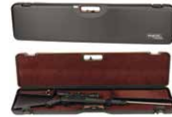
A Superb Travel Case for Scoped Rifles Up to 44" Long; Handsome Italian Styling

Negrini's compact rifle case proves that a sturdy travel case does NOT have to be ugly! This trim, attractively styled rifle case is internationally