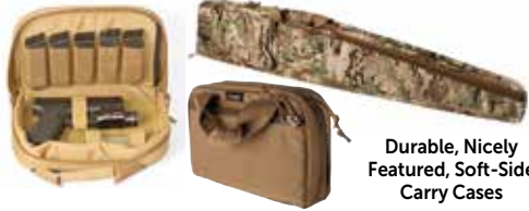
Durable, Nicely Featured, Soft-Side Carry Cases

Armageddon's cases have plenty of padding to protect guns from bumps, dings, and other impact. Over the high-density closed-cell foam padding is an outer shell of high-grade, mil-spec 1,000 denier solution-dyed Cordura® nylon to stand up to hard use and being dragged to heck and back. Perfect Pistol Case easily holds a full-size 1911 in its main compartment, measures approximately 11.5" long x 7.5" high x 3" deep. Five elastic magazine slits and a full Velcro®-lined inner panel make it easy to transport the pistol, mags, a suppressor, and other gear to the range without having them bang into each other on the way. Precision Rifle Case is long enough to hold a bolt-action precision rifle with a scope and suppressor attached (internal length is about 57.5"). No more having to unscrew the can to get the rifle in the case or leave the back of the stock hanging out because you can't zip the zipper all the way. Has the same dense-cell 1/2" foam padding as the cases Armageddon makes for the U.S. Military. Big exterior side pocket for spotting scope, rangefinder, spare mags, boxes of ammo - whatever. Front zippered document/small item pocket. Nylon webbing carry handles and shoulder strap.