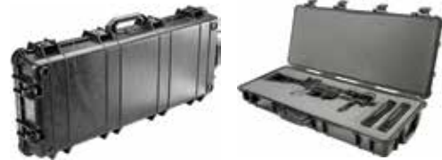
Superb Carbine-Length Hard Case for Your MSR

A strong, rugged hard-shell rifle case with plenty of room inside. Made of Pelican's flavor of reinforced polypropylene and O-ring