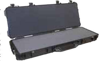
Unbreakable Hard Shell Protects Your Gun From Dust, Water & Shock

Pelican's super-tough, lightweight, hardshell 1720 case protects your valuable gun from just about any punishment you can dish up, from everyday bangs and dings to the rigors of tactical operations. This case even floats, so a gun overboard isn't lost for good. Holds rifles or shotguns up to 42" long, with extra space for handguns, magazines, or other accessories. The outer shell of high impact, polypropylene structural resin has an open-cell core and solid walls to safeguard the guns inside from dust, water, and many chemicals. High-density polyurethane foam inside protects it from vibration and shock. A tongue-and-groove lid with a neoprene sponge O-ring provides an airtight, waterproof seal, while the unique, one-way automatic purge valve equalizes pressure inside for ease in closing the lid. Easy-opening ABS polymer latches lock up good and tight when you want them to; molded-in loops accept padlocks (locks not included) for added security. Long-wearing, stainless steel pins in the hinges and handles provide years of trouble-free service. Durable, polyurethane transport wheels with nylon hubs and steel bearings make this case easy to transport, and it's stackable for easy storage. Meets MIL-STD 4150J and has an Ingress Protection rating of IP-67.