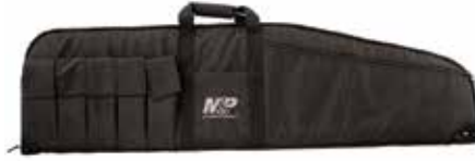
Durable, Good-Quality, Affordable Cases from a Name You Trust

Manufactured by Battenfeld Technologies to Smith & Wesson specifications for proper protection of S&W firearms - and your other guns, too - these cases are made of durable ballistic nylon fabric with heavy-duty carrying handles and plenty of padding inside. Duty Series Gun Cases are designed for carrying tactical rifles, carbines, and shotguns. They offer plenty of room for storing targets and extra magazines by utilizing the multiple magazine pouches and external center-open pocket. Not only is this bag well-equipped to pack supplies, but it also features a full-length zipper for easy rifle access and generous padding for maximum gun protection, making it the ideal bag for any shooter.